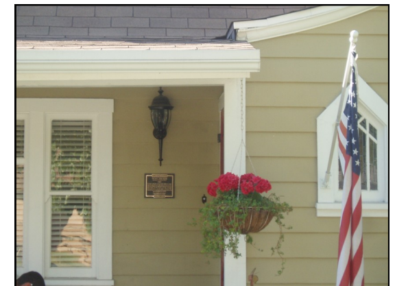
Plaque location at entry to home